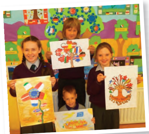
Irish Logo winners